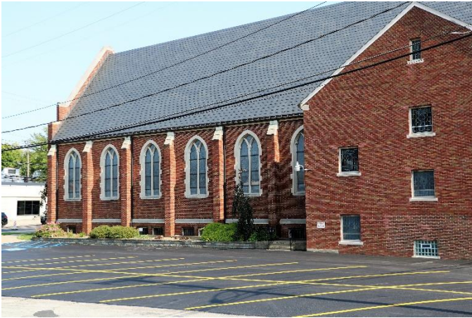
Our newly paved West Parking Lot